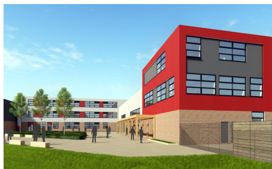
Ready and waiting—the site at Fernwood.

We were delighted to learn last week that planning consent has been given for our permanent home in Fernwood. There are still some final details to resolve but we expect building to commence next month and we are looking forward to marking this historic occasion. Keep up to date by clicking here .