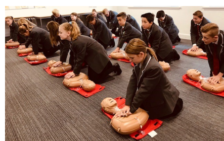
Next generation: students getting to grips with CPR skills and exploring how the heart works in Science.