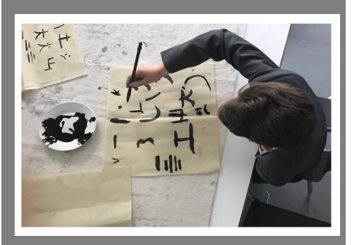
Chinese Club have had the chance to explore Chinese culture and try their hand at the ancient art of calligraphy a: well as learn the language.

Plans to expand our successful Chinese Club have been welcomed by the University of Nottingham whose Masters-level students teach at The Suthers School as part of the programme. Plans are underway to develop a progressive mastery programme as well as another beginners course open to new Year 7s in September.