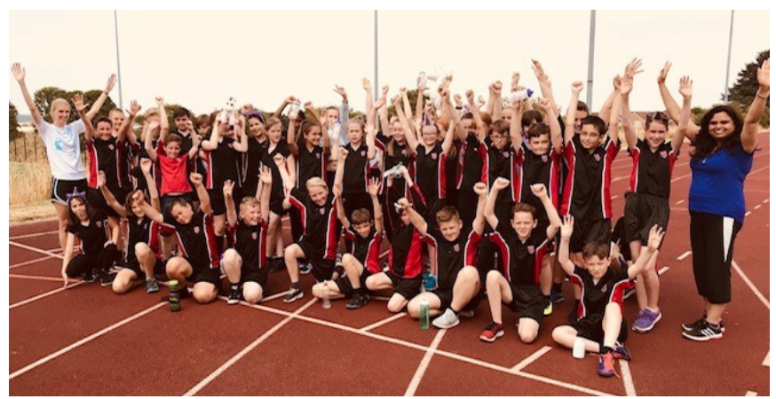
{\it Celebrating their success-staff and students finish their sponsored run in high spirits \#There Are No Short cuts}

Staff and students took to the track last week in aid of Action for Alex, our campaign to raise funds for a six year old girl battling cancer. They clocked up 200km with some students pushing to 10K and beyond! The total raised will be boosted by House Point donations but we look set to smash our target of £100! Sponsor forms and monies raised need to be in by 24 July.