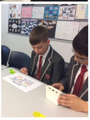
Students got the chance to try their hand at A Levels in Psychology, Business Studies and Theatre Studies.