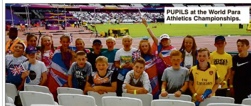
PUPILS at the World Para Athletics Championships.

TWENTY-SIX children from Barnby Road Academy, Newark, went to the World Para Athletics Championships in London.