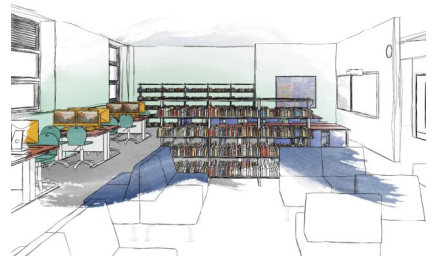
Learning hub: An artist's impression of the open plan library and resource centre that will form part of our new facilities.

With building work underway on the permanent site, planning is now focused on developing the contingency plans for September 2019—April 2020 in collaboration with the ESFA, including the siting of our additional accommodation on the Toot Hill Site.