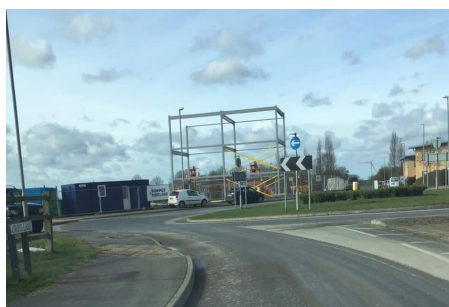
Shaping up nicely: a picture of our build shared on Facebook this week.

This week we met parents of our new Year 7s who will be joining us in September—it was great to be able to meet so many new people and to be able to share recent updates about our new school build. As you can see (left) our brand new building in Fernwood, Newark, is really starting to take shape! #suthersishere