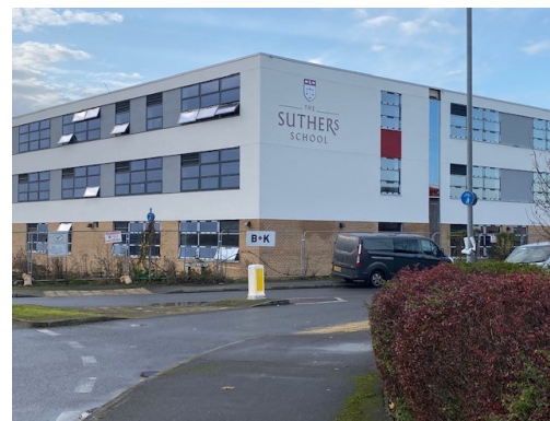
Landmark moment: The Suthers School building standing proud with its brand new badge on show this week.

As those close to our brand new site in Fernwood may already have seen, we were delighted to learn that our school badge has now been added to the side of our building, sitting proud against the brilliant white of the side elevation. We have also been busy organising more site visits for students— more details coming very soon!