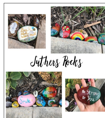
Sitting proud: just a few of the brilliant suthers rocks made by our students during lockdown.

We are delighted that the 'Suthers Rocks' designed and decorated by our students are now sitting proudly on display at the entrance to the school. The positive pictures, affirmations and words are clear visual reminders of the benefits of positive mental wellbeing. Just one of the many ways that students are involved in the development of our amazing new site and it has been wonderful to see students stopping by to take a closer look. You can see just a few examples in the photos here (right).